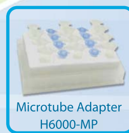
Microtube Adapter H6000-MP

Designed for application flexibility, the Incu-Mixer series is available in two, and four-plate capacities, both capable of accepting all standard plates up to 40mm high. Independent time, temperature and speed controls allow the mixer to function as 3 machines in one; a multi-plate incubator, vortexer, or a combination of the two. The Incu-Mixer MP series is ideal for a wide variety of molecular biology applications including immunochemical reactions, enzyme and protein analysis, and microarray analysis.