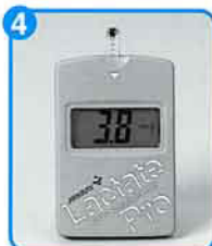
4 Display of blood lactate level.