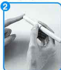
2 Collection of blood.