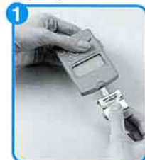
1 Insertion of the test strip.