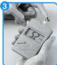
3 Start of measurement.