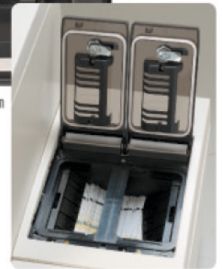
Large Strip Storage Boxes (strip feeders)